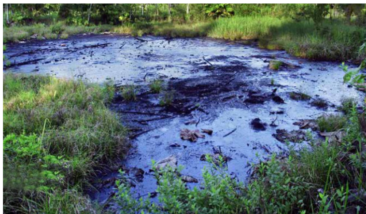
Toxic oil waste pit in Ecuador.