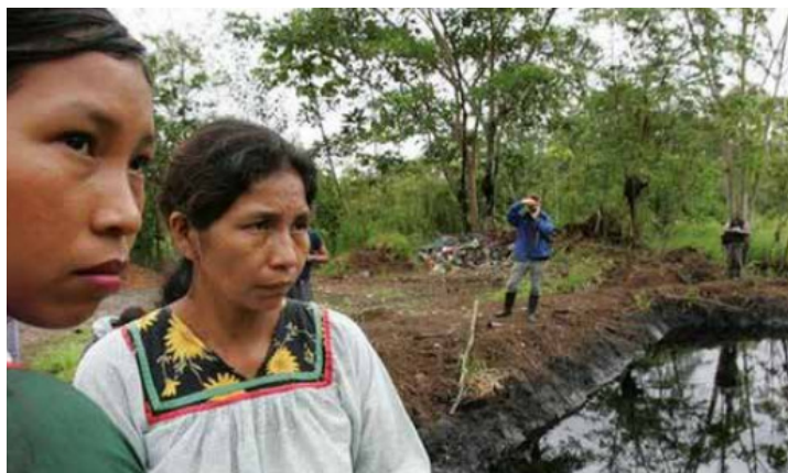
Indigenous people in northeast Ecuador.